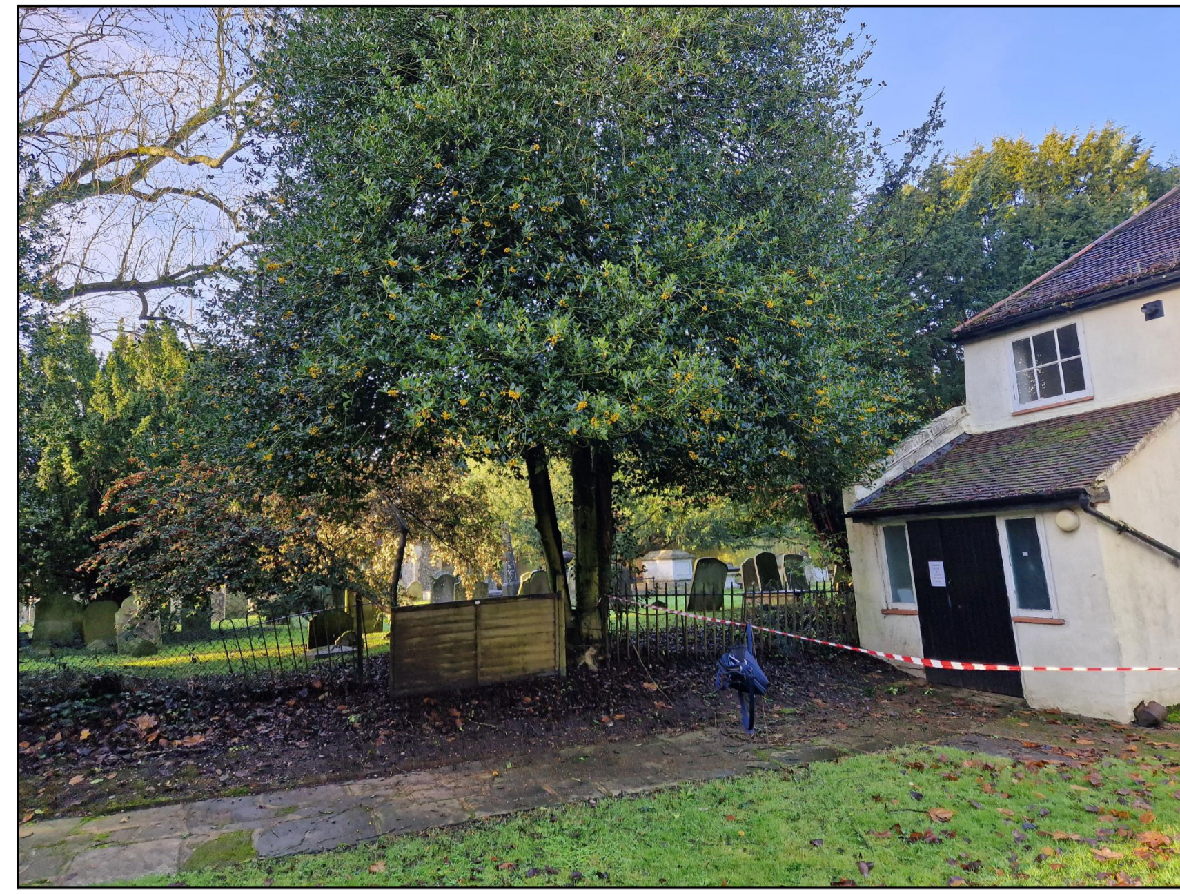
VIEW TO EXISTING CHAIN LINK FENCE