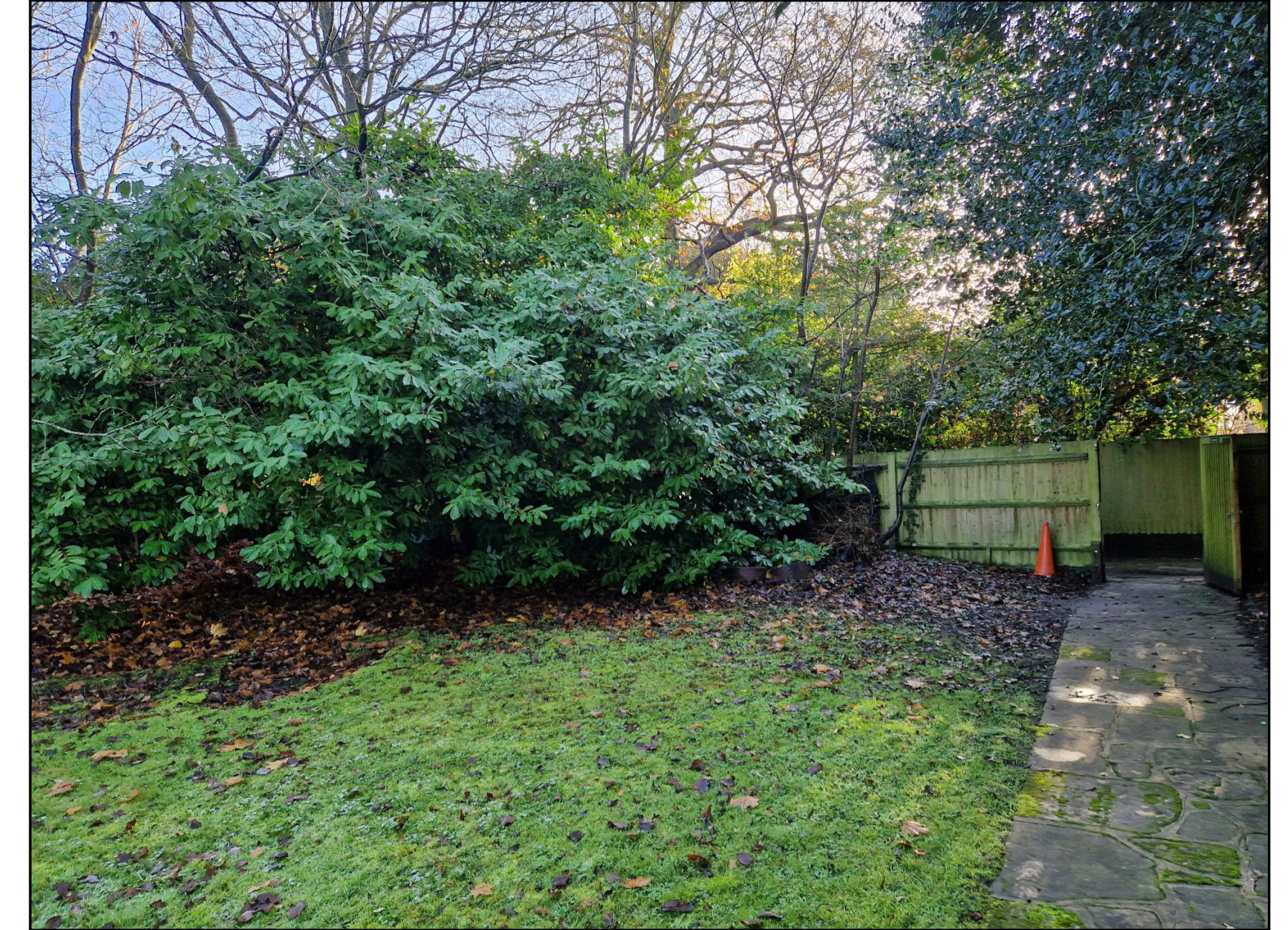
VIEW FROM CHURCH HOUSE TO ALLEY ENTRANCE