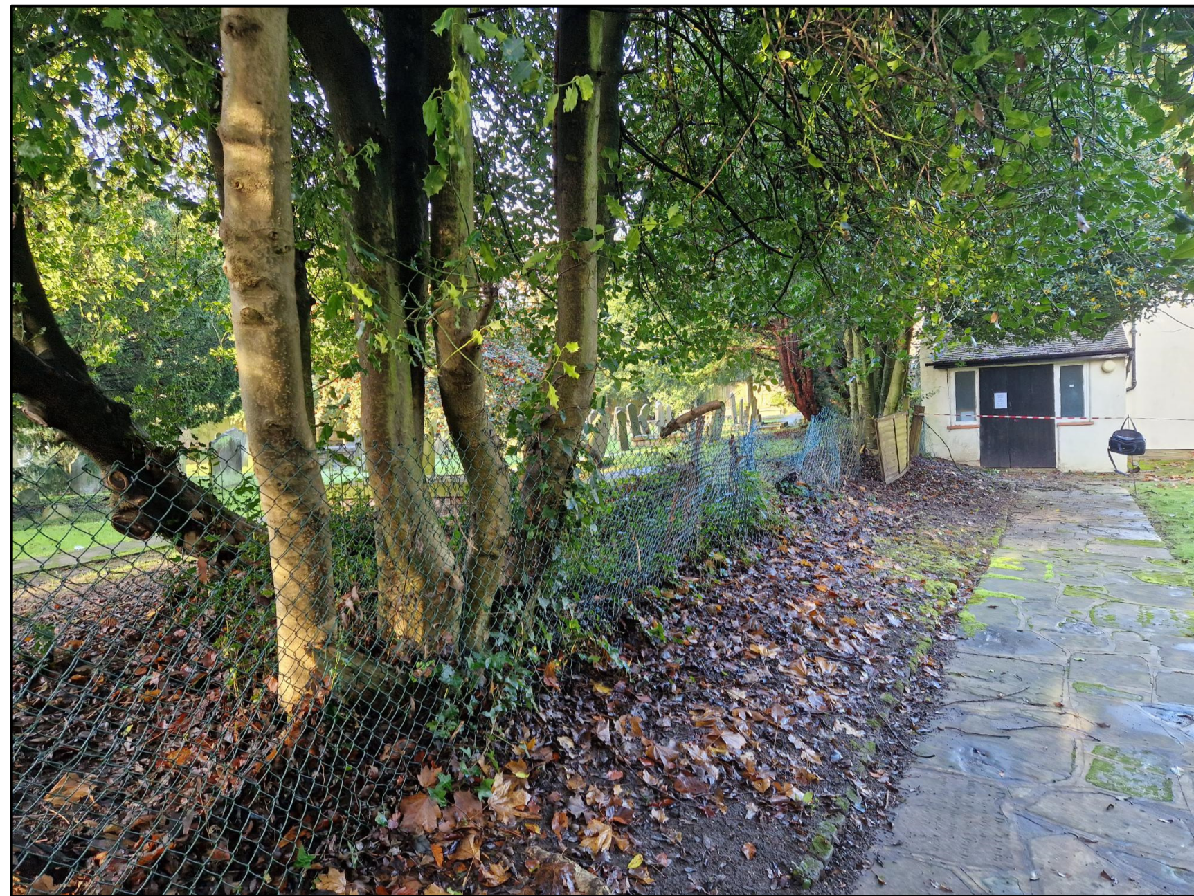
VIEW FROM ALLEY UP TO CHURCH HOUSE